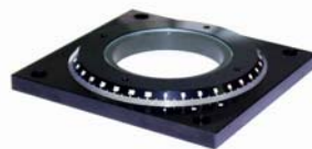
Optional: Rotary table MA 143-6-70 G Division 360°, vernier 10'